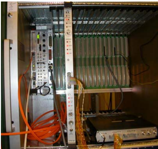
Figure 1: Front view of the RoD crate. From left to right: SBC with TTCpr, TTCvi, TTCvx, VME bus tracer and the RoD Demo.

The ATLAS Tile Hadronic Calorimeter consists of three aligned barrels. The region -1.0 < \eta < 1.0 is covered by the central barrel and the regions 0.8 < |\eta| < 1.7 are covered by the extended barrels. All three of them are divided into 64 wedges, called modules. Each of these modules spans 0.1 rad in the polar angle [2].