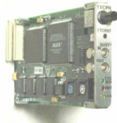
Figure 1. View of TTCPR.

When it became clear that the new TTCRX would be available soon and also that it would not be possible to obtain any more of the older TTCRX chips, the TTCPR was redesigned, and enhancements were added to take advantage of the features of the new TTCRX. This new TTCPR was produced and has been used successfully in data acquisition at the ATLAS Test Beam. The card has also been implemented in the PCI form factor. The TTCPR in the PMC version is shown in Figures 1 and 2.